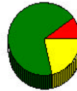
Education - Current Enrollment