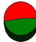
Relationship of Occupant