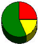
Home Heating Source