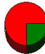
Relationship of Occupant