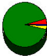
Home Heating Source