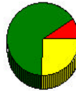
Education - Current Enrollment