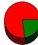
Relationship of Occupant