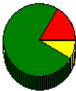
Home Heating Source