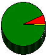
Home Heating Source