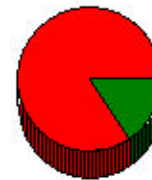
Relationship of Occupant