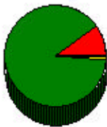
Home Heating Source