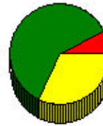
Education - Current Enrollment