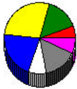
Education - Highest Level Attained