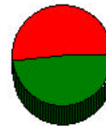
Relationship of Occupant