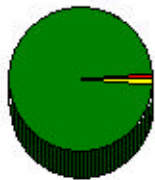
Home Heating Source