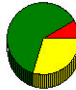
Education - Current Enrollment