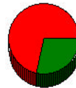
Relationship of Occupant