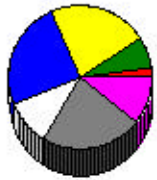
Education - Highest Level Attained